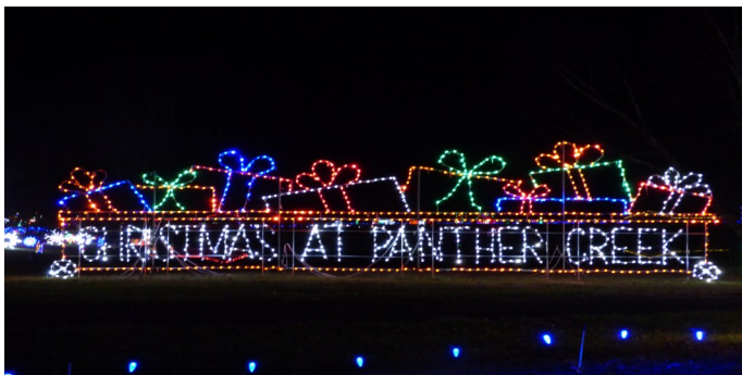
Christmas lights at the entrance to Panther Creek greeted visitors to the light show.