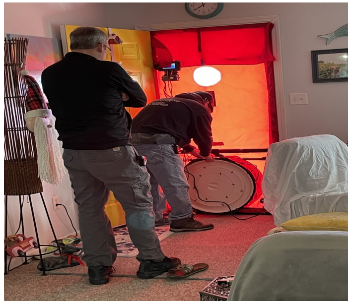
An AACS weatherization team conducts a post inspection at a client’s home in Sturgis, Union County. The team is testing the house to determine if weatherization work is energy efficient.